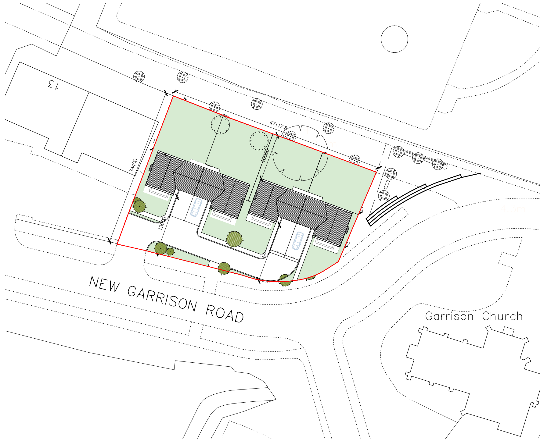
1 Site Plan